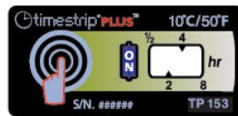
Active – threshold not exceeded