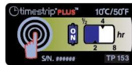
Active – threshold exceeded over 2 hours