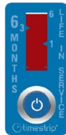
Active – 6 months