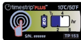
Active – threshold exceeded over 2 hours