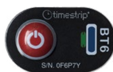
Active – threshold exceeded