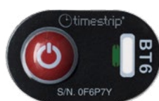
Active – threshold not exceeded