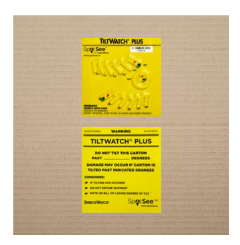
TiltWatch Plus Indicator with Companion Label