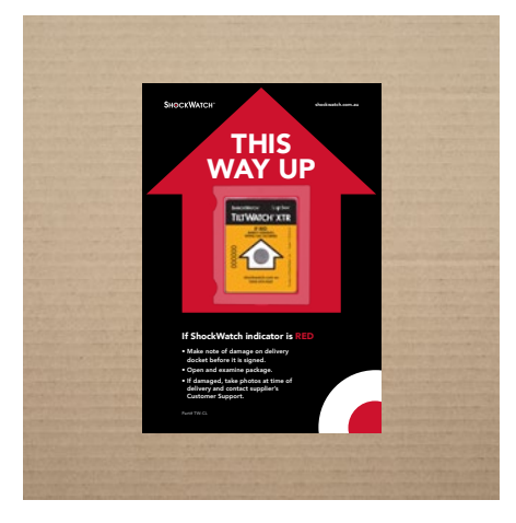
TiltWatch XTR Indicator with Companion Label