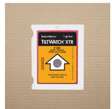
TiltWatch XTR Indicator without Companion Label