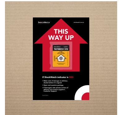
TiltWatch XTR Indicator with Companion Label

Tip: Rough wood and heavily waxed wood containers may require special attention. If the wood is extremely rough, we recommend the use of a spray adhesive to increase bonding strength.