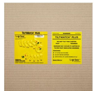
TiltWatch PLUS Indicator with Companion Label