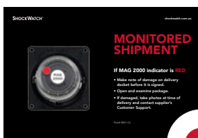
MAG 2000 with Companion Label

While these instructions are considered best practices, each situation may be different. If you have any further questions or would like to reorder, please either email us at solutions@shockwatch.com.au or call 1300 074 625 .