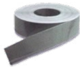
Reflective Coded Bands

Please note: In addition to the components featured above, every LSA system comes with all the items required (cabling, wiring, fasteners, brackets, etc) for a complete installation.