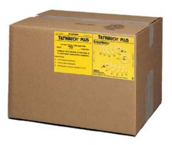
Tiltwatch Plus in this photo is featured with a companion label.