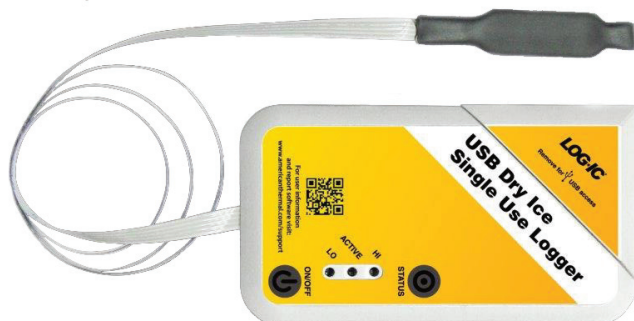
Dry Ice Single Use w/ Ribbon Probe