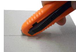
2. Release blade slider while cutting.