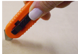
1. Push forward the blade slider to extend blade