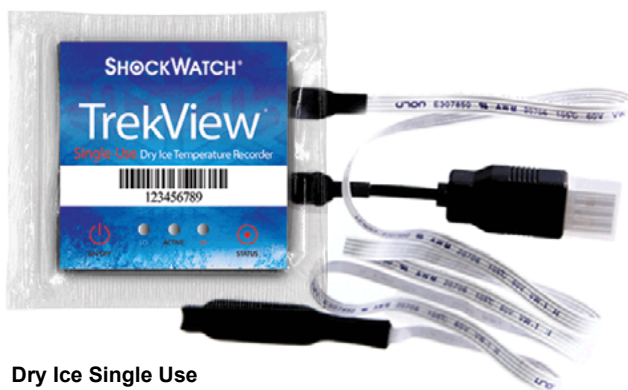
Dry Ice Single Use w/ Ribbon Probe