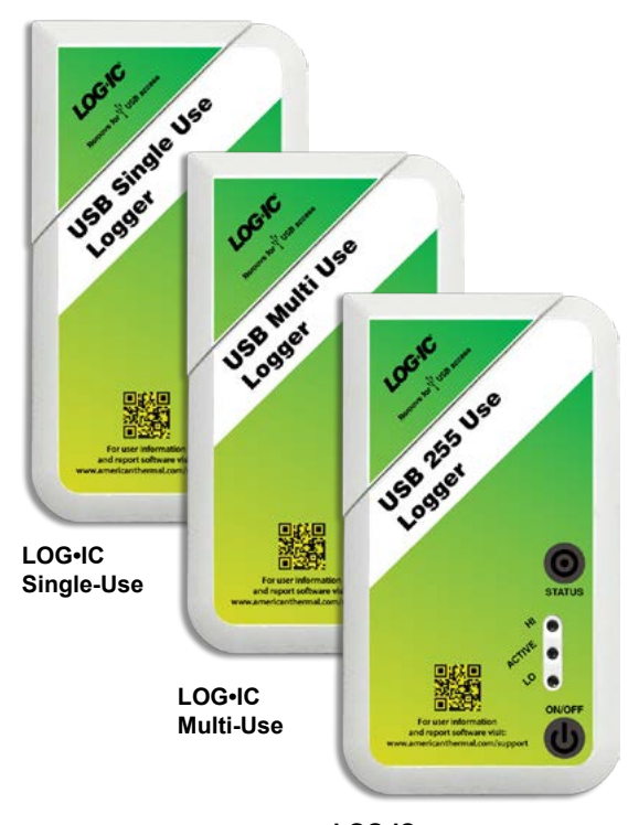
LOG•IC 255 Use