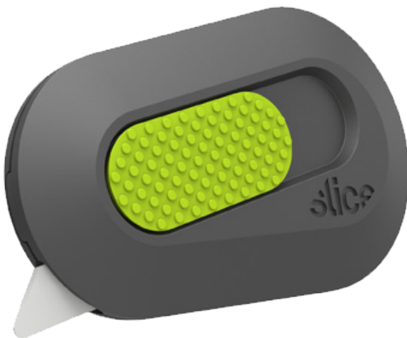
Code: SLICE-MINI CUTTER

SLICE-MINI CUTTER is perfect for opening small boxes, bubble wraps, removing shrink-wrap, pallet coverings, plastic packaging, and more.