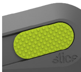
Rubberised comfort blade slider