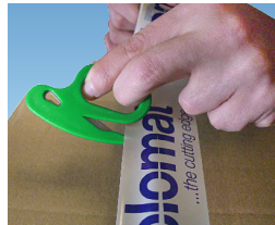
Easy to operate and helps reduce injuries.