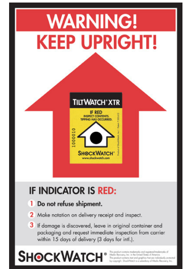
Tiltwatch XTR companion label