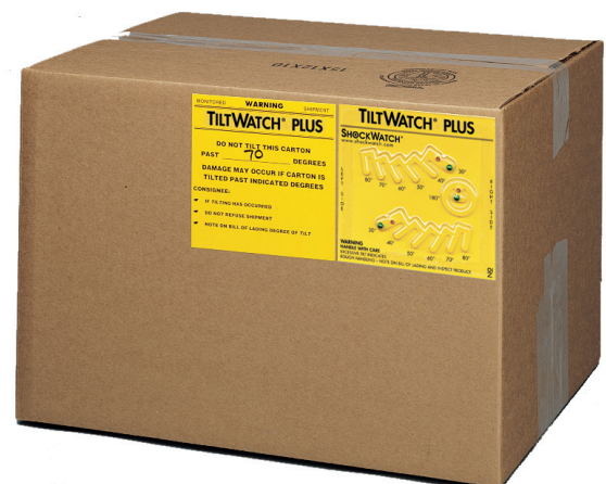
Tiltwatch Plus in this photo is featured with a companion label.